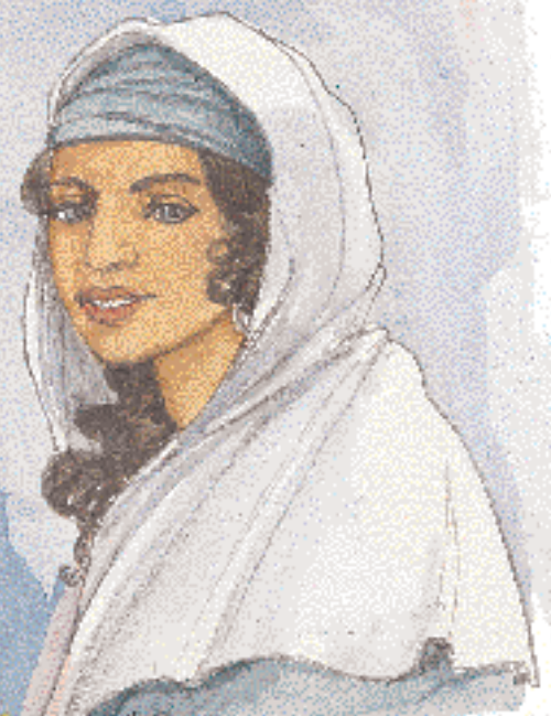
Joseph and Rahab, Heroes of Faith by the Grace of God

2. How did his or her faith in God influence his or her decision?