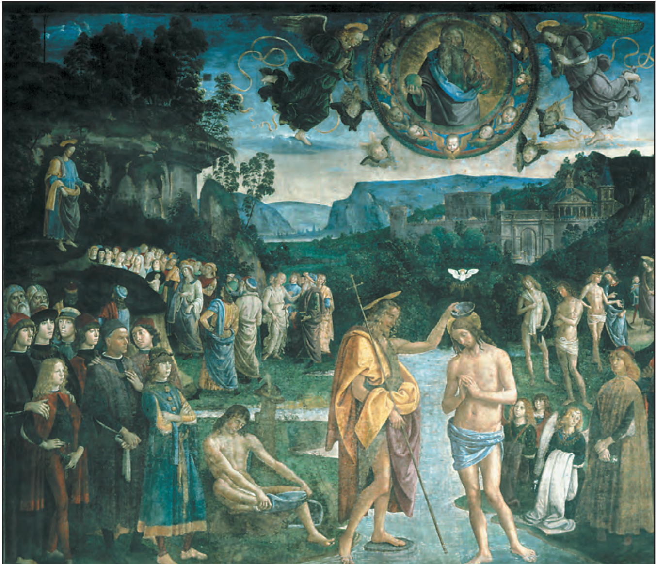
The Baptism of Christ by Giovanni Bellini Sistine Chapel, Vatican, Rome, Italy