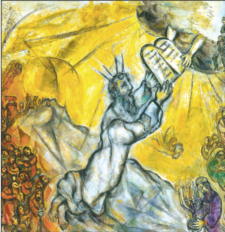
Moses Receives the Tablets from the Lord by Marc Chagall