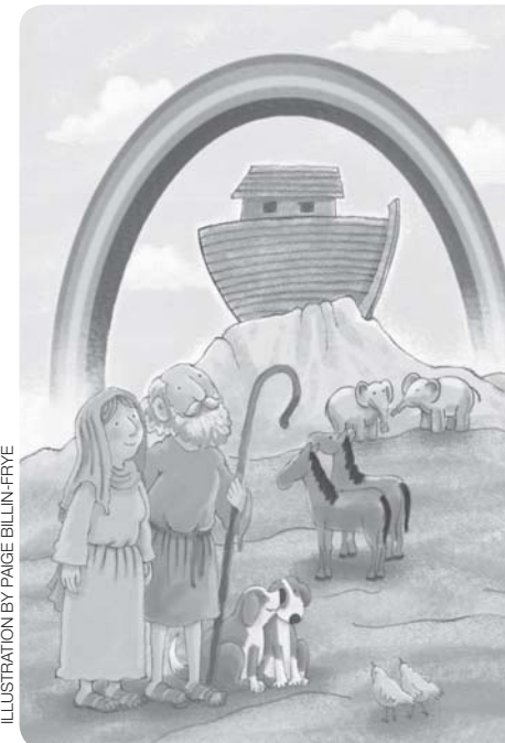
ILLUSTRATION BY PAIGE BILLIN-FRYE

*Photocopy the Take-Home page at the end of this lesson for each child.