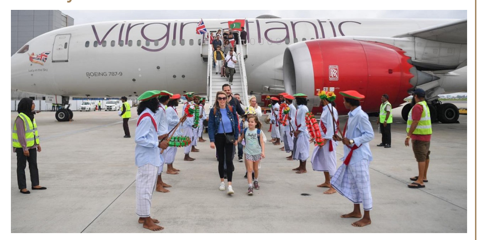
The Ministry of Tourism has revealed that more than 400,000 tourists have visited the Maldives so far this year.

The latest statistics published by the tourism ministry show that a total of 423,863 tourist arrivals visited the Maldives as of March 2, which is an increase of 16.9% compared to the 362,559 arrivals during the same period last year. The statistics show that that over 200,000 tourist arrivals visited the Maldives in February, marking a historic first.