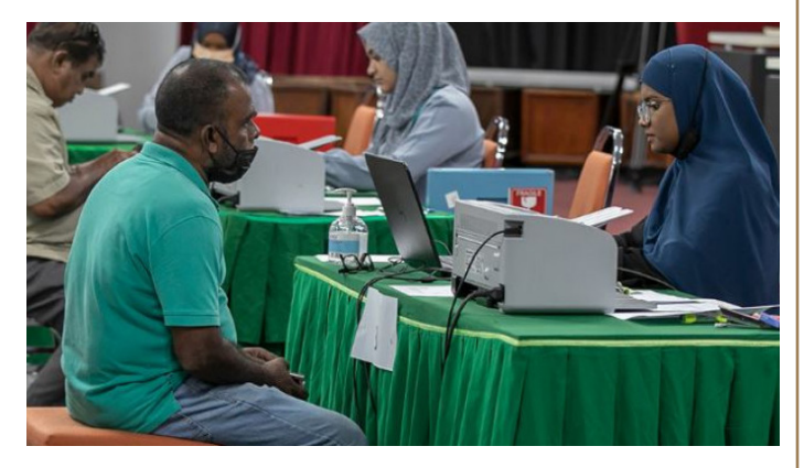
Moreover, the payable zakat is determined based on the consumption of 2.4 kilograms of wheat.

Various online platforms have been provided for the convenience of zakat payments, including the Dhiraagu app, Dhiraagu pay, SMS, Ooredoo M-Faisaa, Ooredoo pay, Maldives Islamic Bank Mobile Application, Faisaa net, Bank of Maldives (BML) portal, Fahipay application and website, as well as Bandeyri Pay.