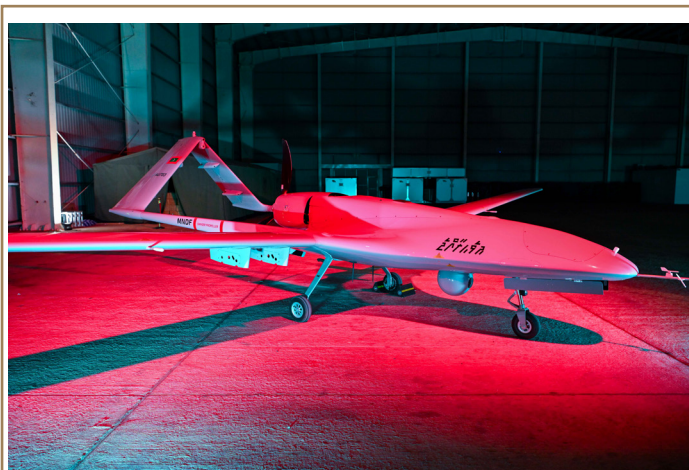
MNDF Air Corps newly inducted unmanned aerial vehicle (UAV)