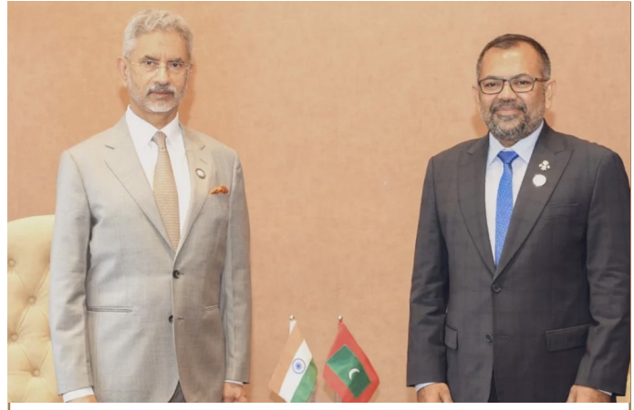
Minister of Foreign Affairs Moosa Zameer and Minister of External Affairs of India, S. Jaishankar

An objective of this meeting is to fortify and enhance the existing ties between the two nations, underscoring the commitment to fostering robust and enduring diplomatic relations. SOURCE: PSM