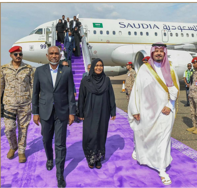
The Emir of the Madinah Region receives His Excellency Dr. Mohamed Muizzu, President of the Republic of Maldives, and his accompanying delegation.

SOURCE : @MMuizzu, Official Tweeter of His Excellency President Dr. Mohamed Muizzu