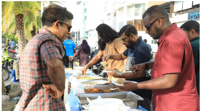
Public participating in morning breakfast after Eid Prayers