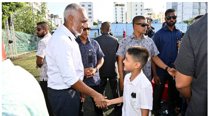
President Dr. Muizzu exchanges Eid greetings after Eid Prayer