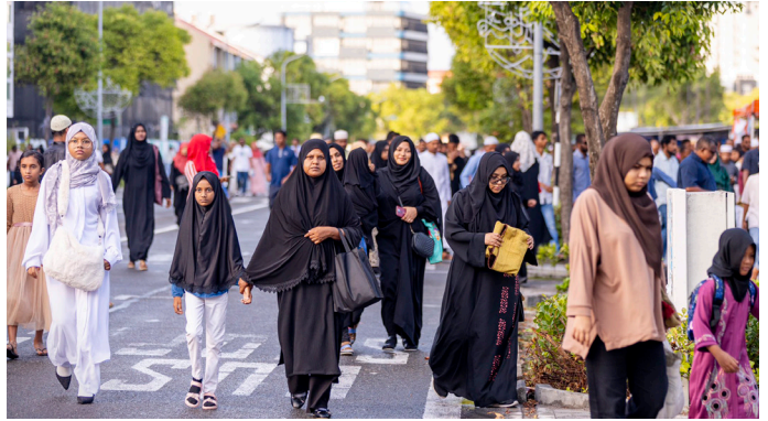
Families are leaving after Eid Prayer at Hulhumalé Synthetic Track