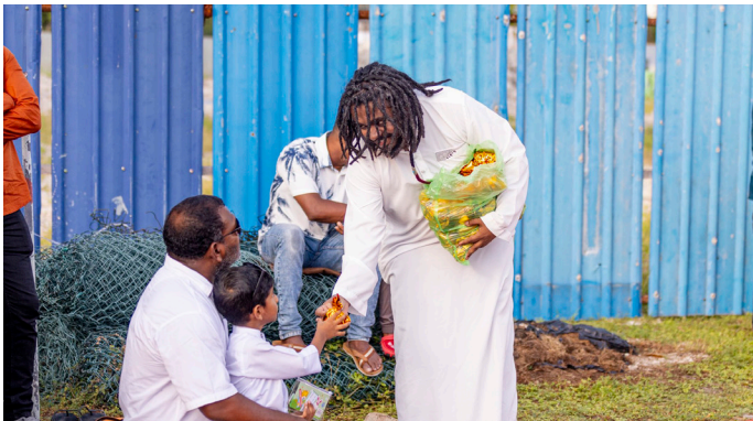
Exchanging gifts, a tradition of Eid Celebration