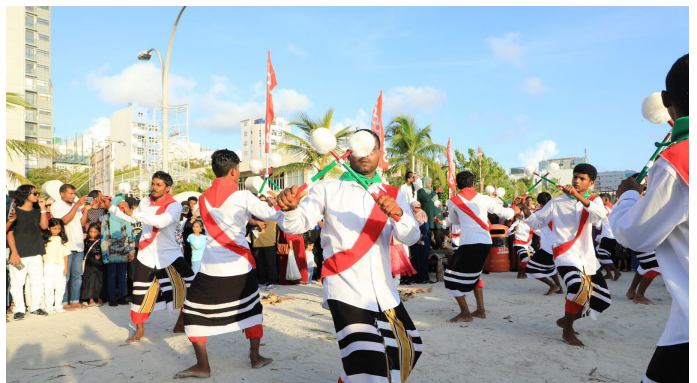
A traditional dance performed at Rasfannu, Mwalé