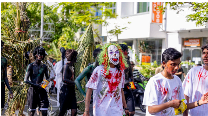
Maali Parade in Hulhumalé