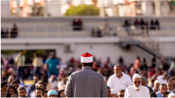
Eid Prayer is performed at Hulhumalé Synthetic Track