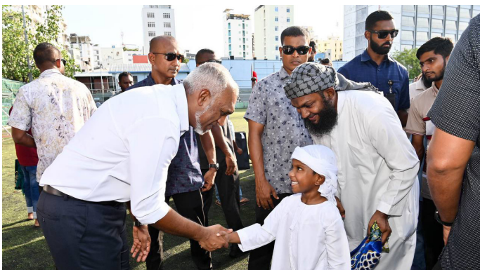
President Dr. Muizzu exchanges Eid greetings after Eid Prayer