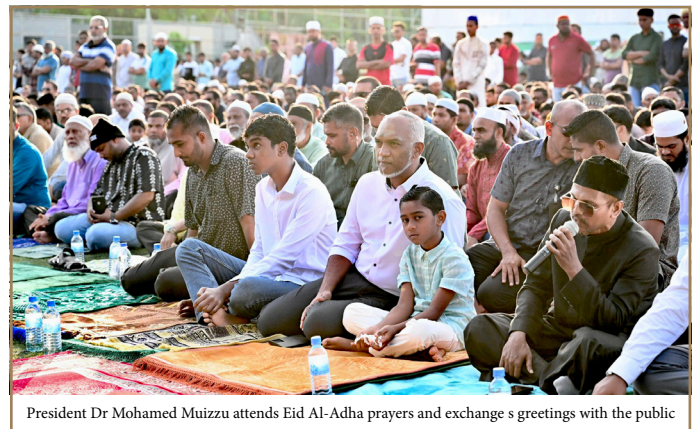
President Dr Mohamed Muizzu attends Eid Al-Adha prayers and exchange s greetings with the public

His Excellency President Dr. Mohamed Muizzu