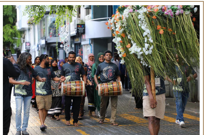
Celebrated in its own unique way, Eid al-Adha in the Maldives is not only a festival of prayer and feasting but also a carnival of colours, music, dancing and joy. Koadi kendun is one such artistic and traditional performance celebrated on the eve of Eid.