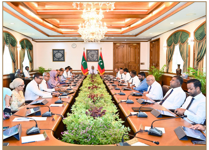
Cabinet Meeting on 30 June 2024 - File phot

Observed annually on July 8, National Writers' Day is a momentous occasion. It marks the anniversary of the first literature publication "Al-Islah."