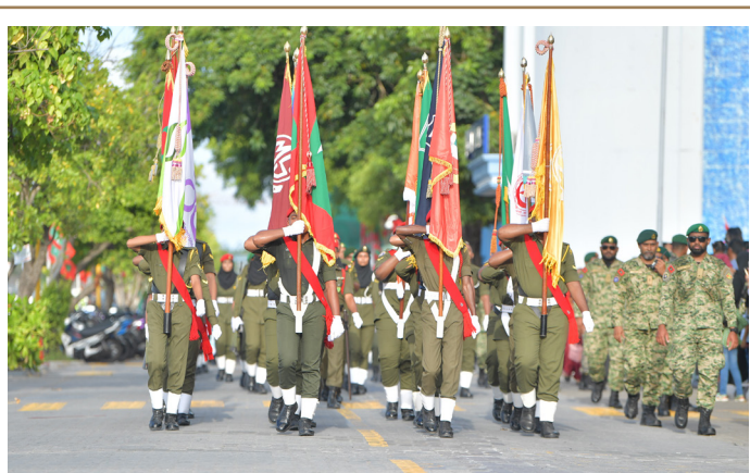
Maldives National Cadet Corps (MNCC) participating during Independence Day celebration held in Malé. (File Photo)