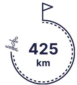
Alpine ski slopes