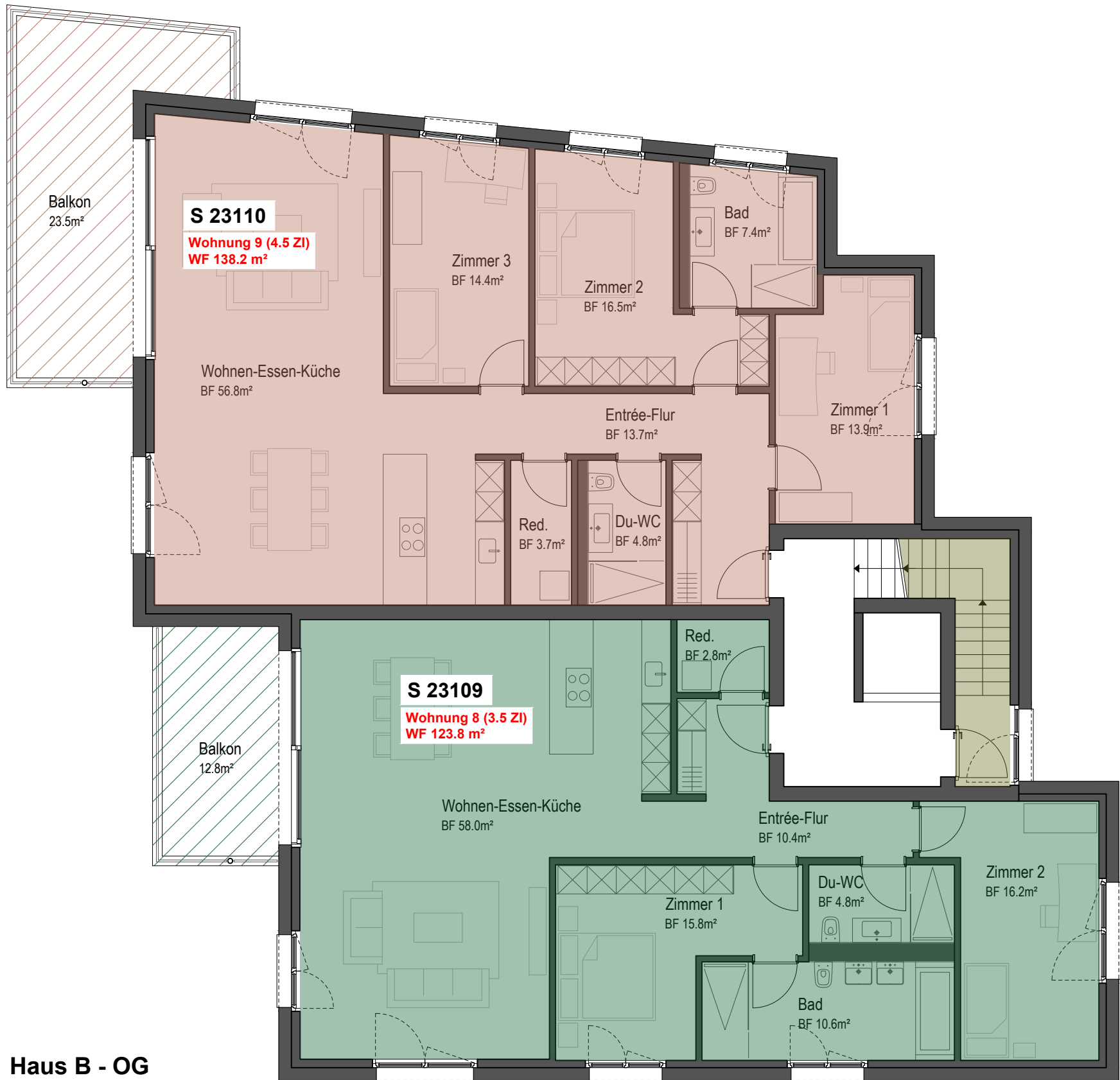
Haus B - OG