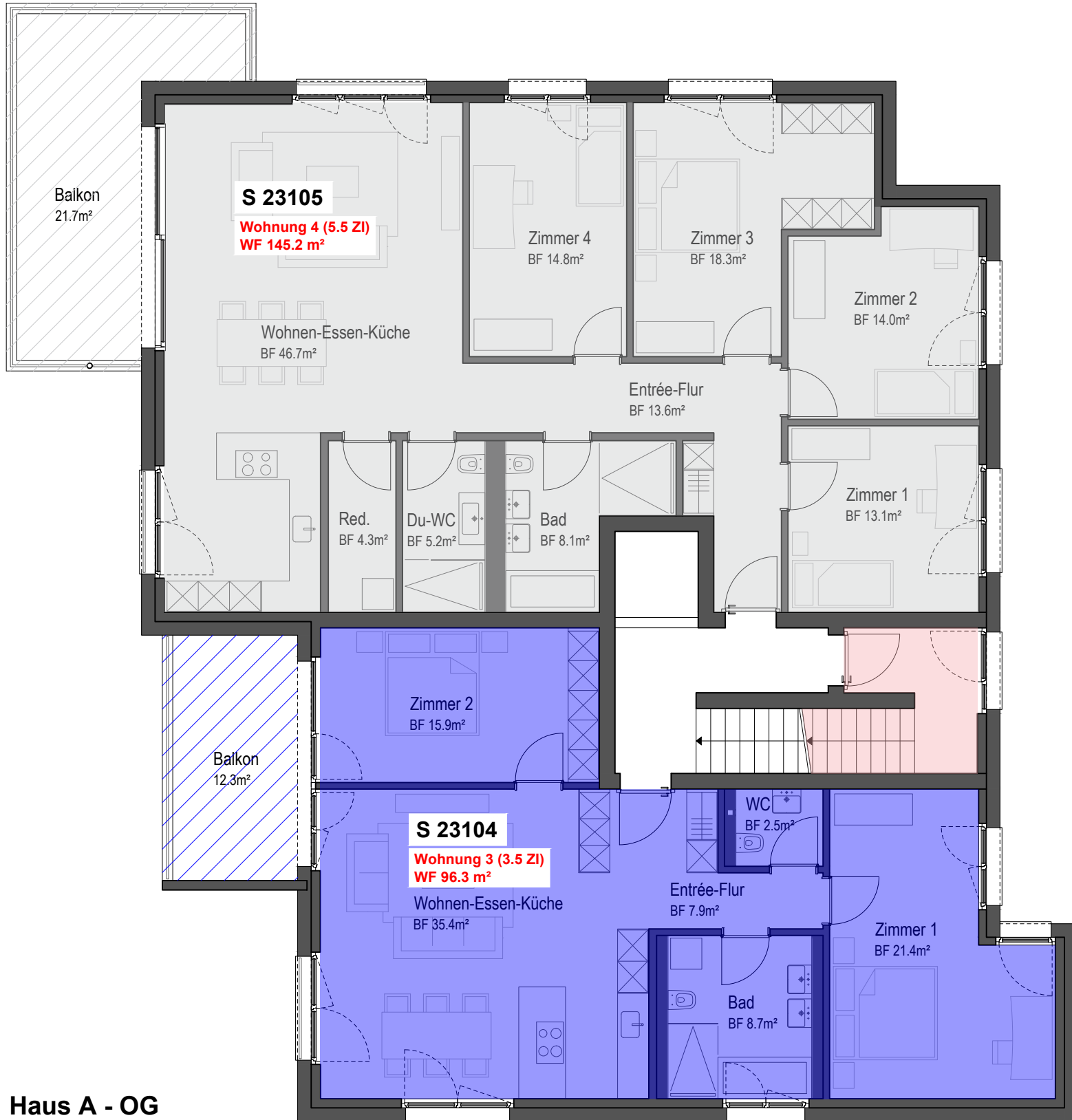
Haus A - OG