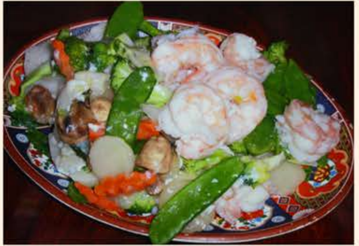
LAKE TUNG TING SHRIMP