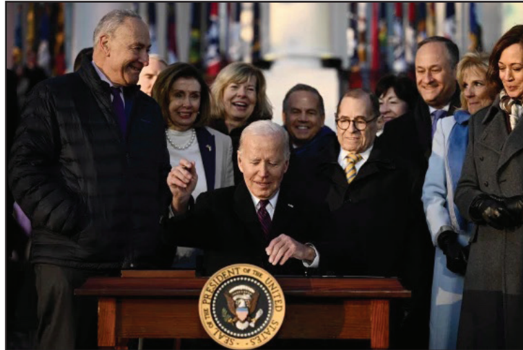
President Joe Biden signs the Respect for Marriage Act on the South Lawn of the White House on Tuesday.

The legislation Biden signed was drafted by a bipartisan group led by Sen. Tammy Baldwin, D-Wis., the first openly gay person elected to the Senate. It will ensure that the federal government recognizes marriages and guarantee full benefits "regardless of the couple's sex, race, ethnicity, or national origin." The law will not, however, require states to issue marriage licenses contrary to state laws.