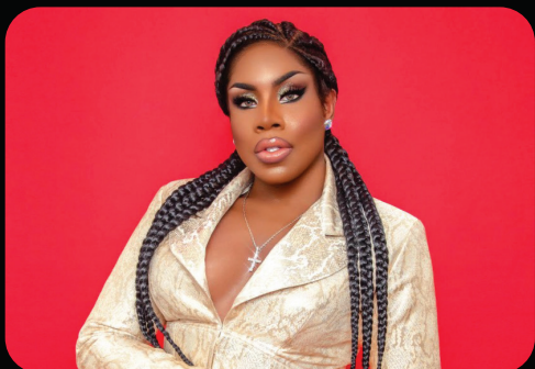
MONET X CHANGE