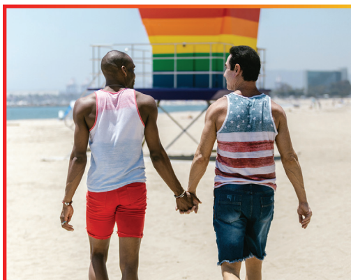
DHS Approved 10/15/2020

For information on long term care options, call your local Aging and Disability Resource Center.