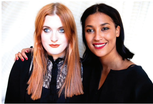
Icona Pop - Saturday Headliner