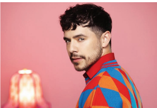
David Archuleta - Friday Headliner