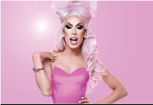
Alaska Thunderfuck - Thurs. Headliner