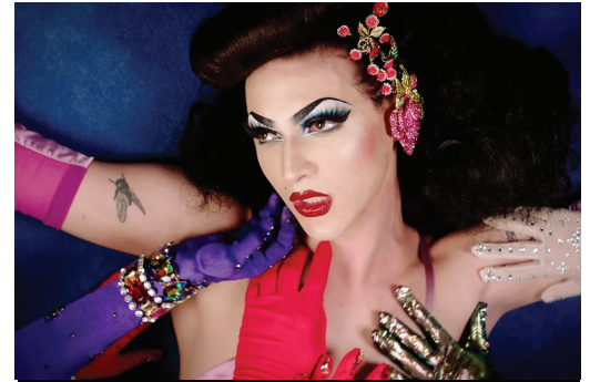
Violet Chachki - Thursday Headliner