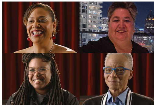
The Power and Politics of Intersectionality