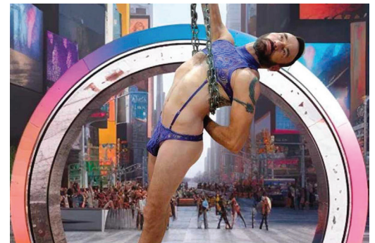
Bottoms Up Aerial Burlesque Show