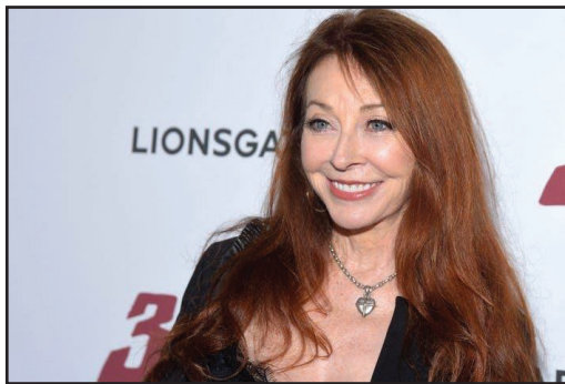
Cassandra Peterson/ Elvira

• Certainly not least, Elvira revealed she is queer and has been in an open relationship with a woman for 20 years. In September, Cassandra Peterson , Elvira, published her autobiography titled