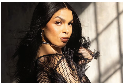
Jordin Sparks- Friday Headliner