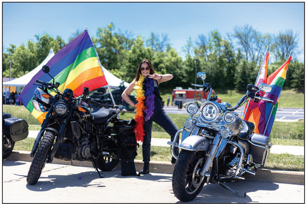
The 2025 Ride With Pride will take on Saturday, June 7.

The day before Point Pride, local businesses will host a traditional bar crawl with drink specials, a crawl cup and more. Get your punch card marked to be