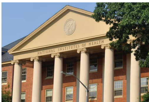
The National Institutes of Health campus in Bethesda, Maryland, in 2015.