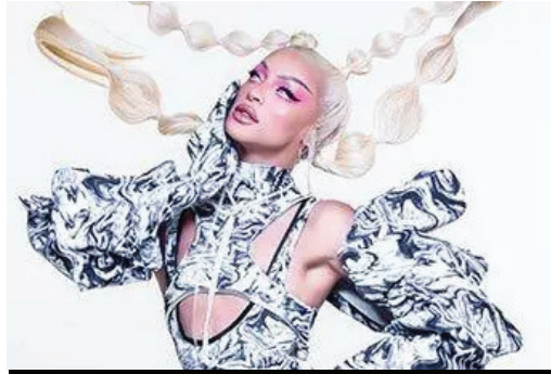
Pablo Vittar - Friday Headliner