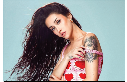
Adore Delano - Thurs. Headliner