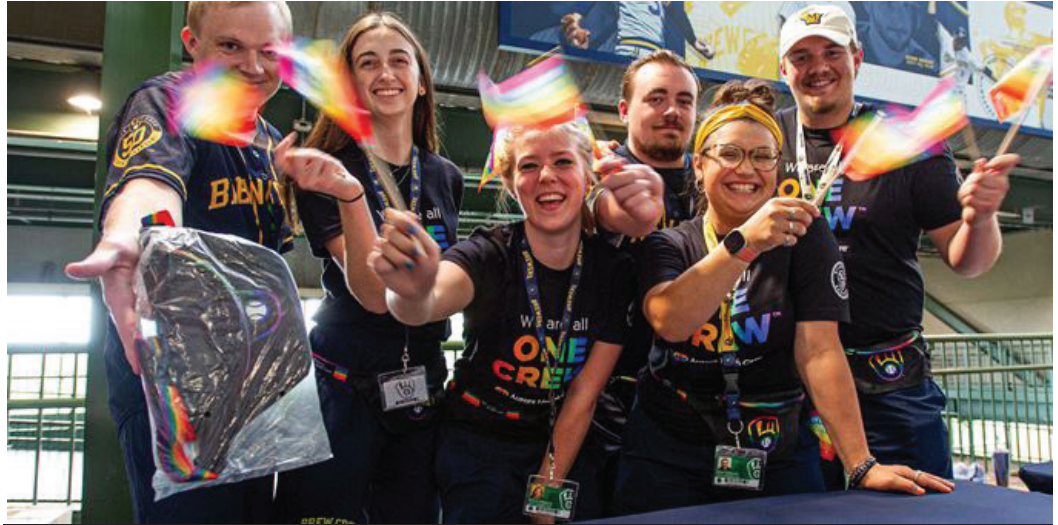
The Milwaukee Brewers will host Pride Night on Thursday, June 12, 2025.

It's the 21st anniversary of the Pride Parade in Milwaukee; this year's theme is "Remember, Resist, Rejoice." Last year, over 200 groups marched in the parade which drew in thousands of people.