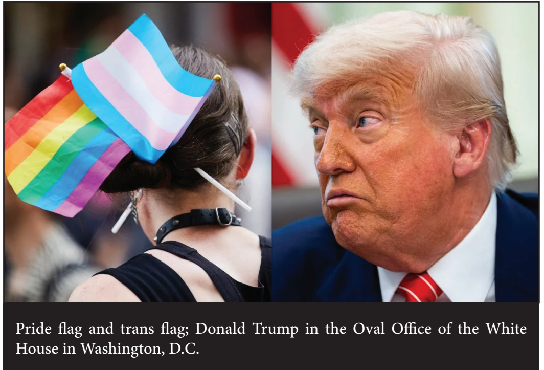
Pride flag and trans flag; Donald Trump in the Oval Office of the White House in Washington, D.C.

"By prohibiting sex-based discrimination in federally funded programs, #TitleIX opened countless athletic & academic opportunities for women & girls across the country. This month, we celebrate Title IX's 53rd anniversary &