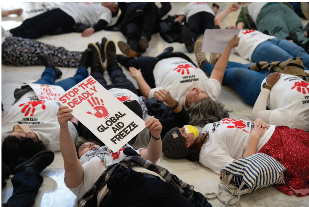
A protest against cuts to American foreign aid spending, including USAid and the PEPfar programme to combat HIV/Aids, on Capitol Hill in February.

In 2012, the FDA approved pre-exposure prophylaxis (PrEP), an antiviral drug taken once a day that is highly successful at preventing new HIV infections. While the drug has been a power-