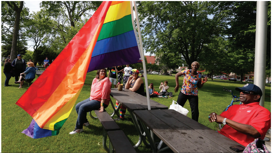
Sheboygan Pride Picnic will take place on Saturday, June 28, 2025.

This family-friendly pride event features live entertainment, face painting, games,