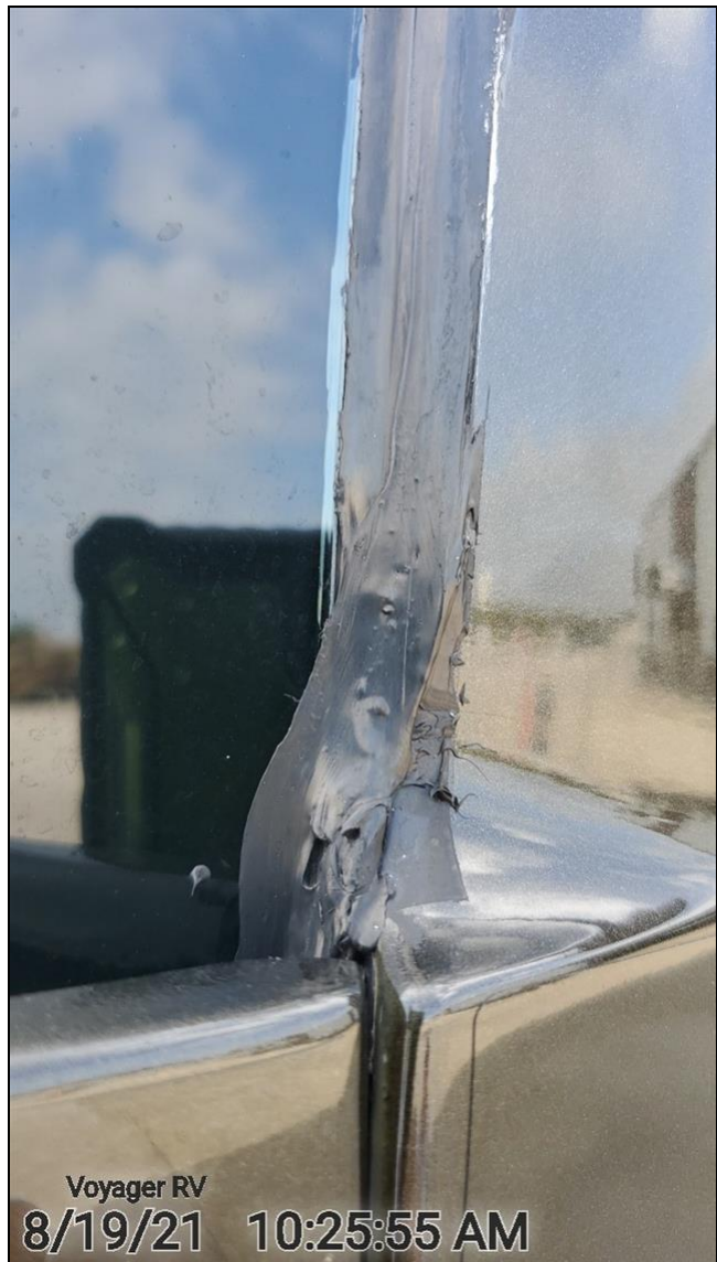
Streetside Bottom Corner Sealant