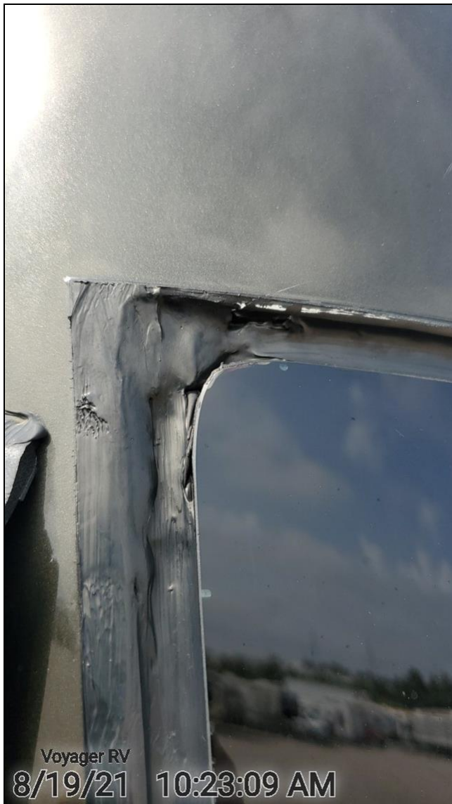
Curbside Top Corner Windshield Sealant

Observed inconsistent sealant application along windshield. No evidence of leakage noted.