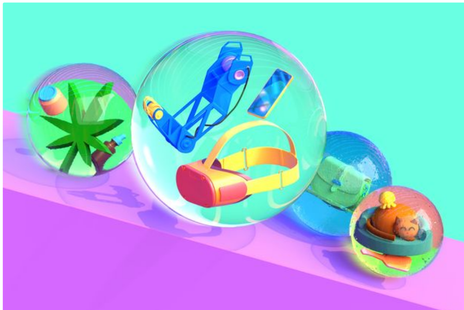
Illustration by Simoul Alva

By Karishma Vanjani Follow Updated Dec. 9, 2022 8:39 am ET / Original Dec. 9, 2022 1:30 am ET