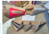
"MXR_ARCH_II" - Acrylic, Walnut, Veneer and Tempered Glass, 13" x 8" x 6", 2021.

In a field I am the absence of field. This is always the case. Wherever I am I am what is missing. When I walk I part the air and always the air moves in to fill the spaces where my body's been. We all have reasons for moving. I move to keep things whole.