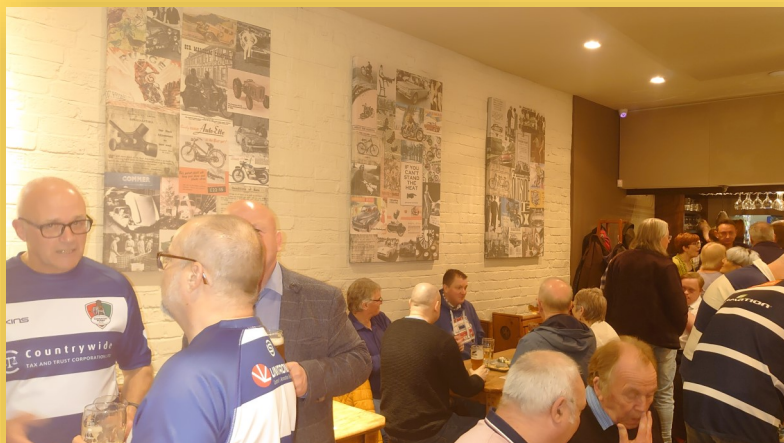
Chit Chat Time