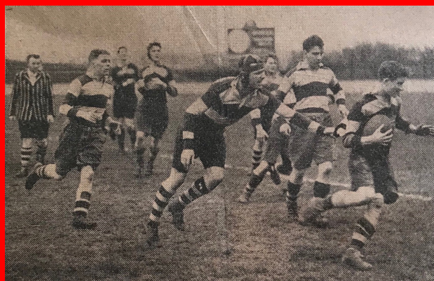
AHG Purchas, April 15th , 1939, Coundon Road ( obviously the ideal position for the scoreboard and clock!)