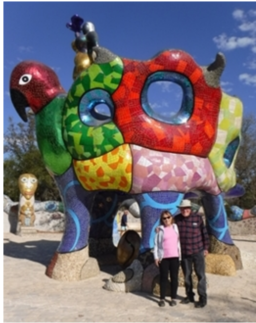
One of our favorite 2021 visits... in Queen Califia's Magic Circle, Escondido [near San Diego]

We did manage some travel after vaccinations and boosters and during covid lulls: car trips to the Chesapeake area (spring there, still winter here), New England (Maine coast, Mass. and RI – a yummy evening at the Matunuck Oyster Bar!). Spring and late fall by air to Portland to see Graham & family w/side trips to Utah and San Diego.