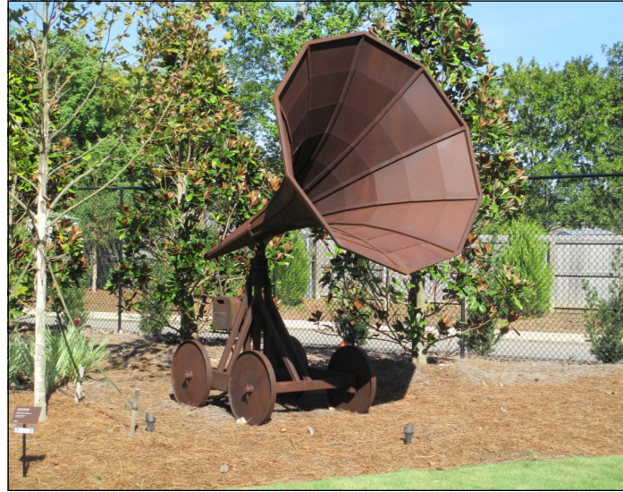
One Of The Many Sculptures Inside The New Sculpture Garden