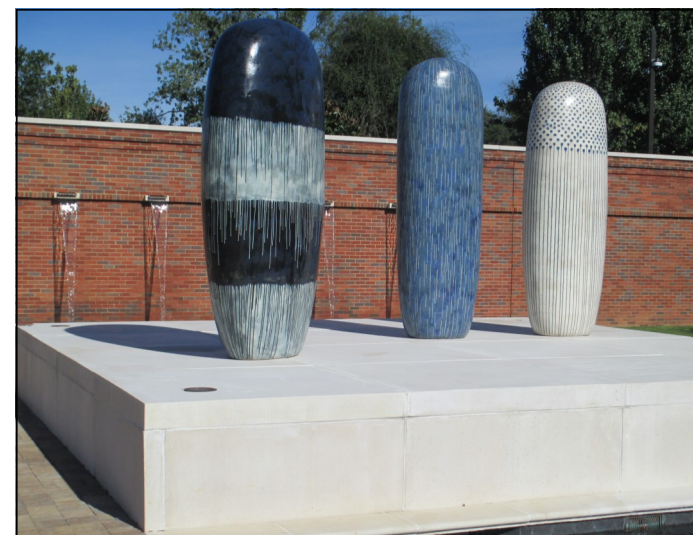
One Of The Many Sculptures Inside The New Sculpture Garden

"Two sounds of autumn are unmistakable.....the hurrying rustle of crisp leaves blown across the street by a gusty wind.....and the gabble of a flock of migrating geese."---Hal Borland