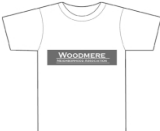
Shirts will be on sale at the August 9 General Meeting.