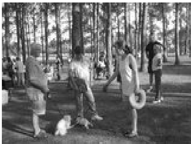
Neighbors and their dogs met each other at the Day in the Park.