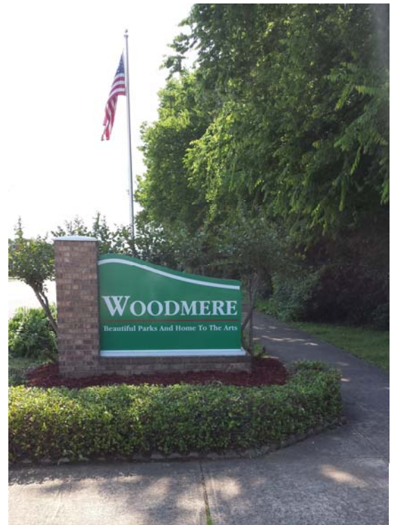
Our sign after some hard work on Clean-Up Day