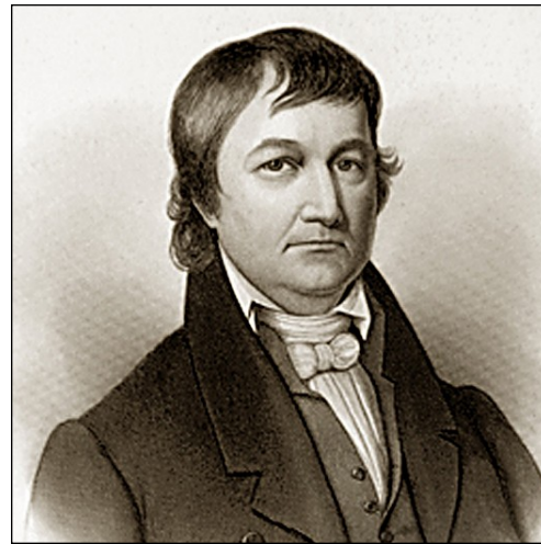
General John Coffee

After the battles of Burnt Corn and Ft. Mims, volunteer armies from the Mississippi Territory and from Tennessee and Georgia combined with friendly Choctaw and Creek warriors began to march into the Alabama Territory to attempt to quench the uprising of the Red Stick Creeks and protect the settlers in the territory. In our previous visit, remember that General Claiborne pushed into Alabama from Mississippi and eventually engaged the Red Sticks at the Battle of Holy Ground. Meanwhile, General John Floyd was advancing into the territory from Georgia in an attempt to drive a wedge through the center of the Creek Nation. At relatively the same time, General Andrew Jackson was entering the Alabama Territory from Tennessee with a group of volunteers. Joining Jackson near present-day Huntsville was General John Coffee (ref: present-day Coffee County) with another group of volunteers, mostly cavalry. With these Tennessee Volunteers was none other than Sam Houston and Davy Crockett.