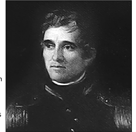
General John Floyd