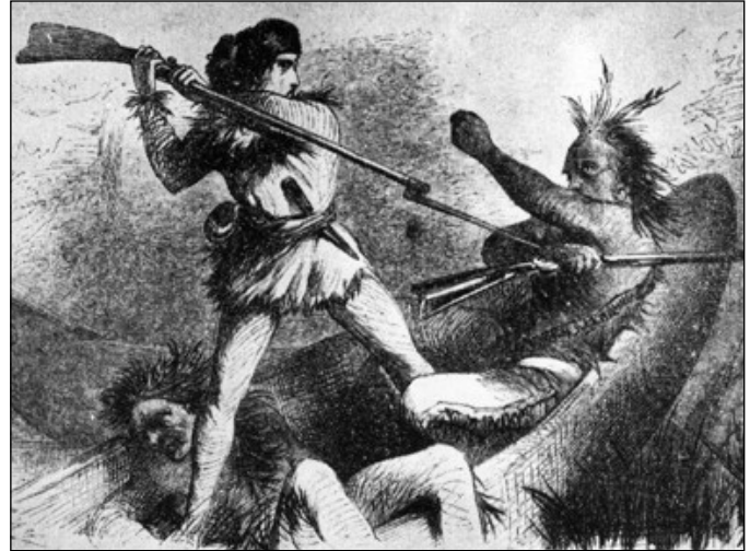
The Famous Canoe Fight