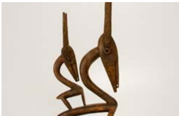
African Crest Mask: Female Antelope