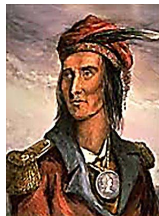
William Weatherford, Red Eagle