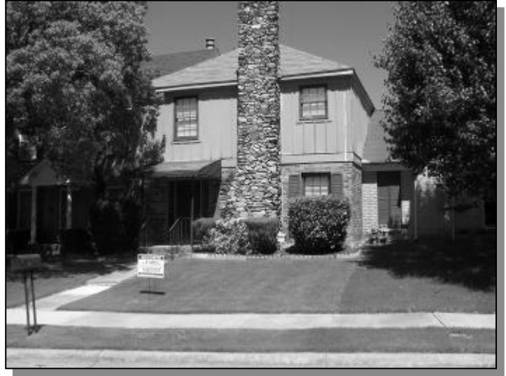
1619 Sandstone Court