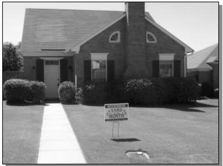
1604 Salisbury Place