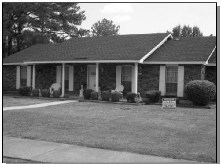
5808 Green Way Drive