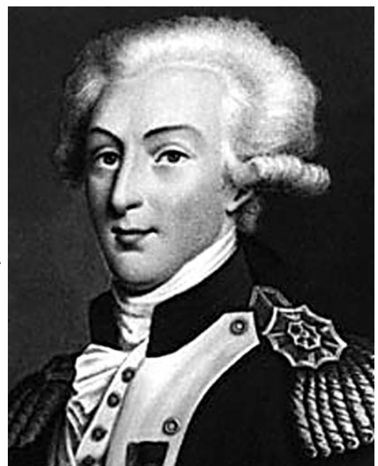
The Marquis de Lafayette