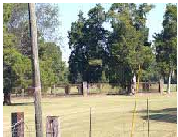
Old Augusta Cemetery is located just off Ware's Ferry Road near Dozier Road, Montgomery, Alabama.