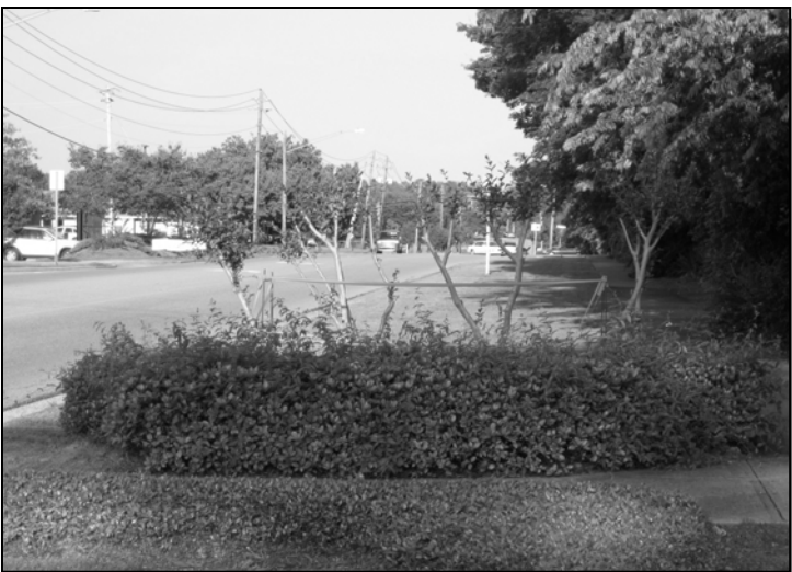
Location of new Woodmere Neighborhood Association sign on Carmichael Road