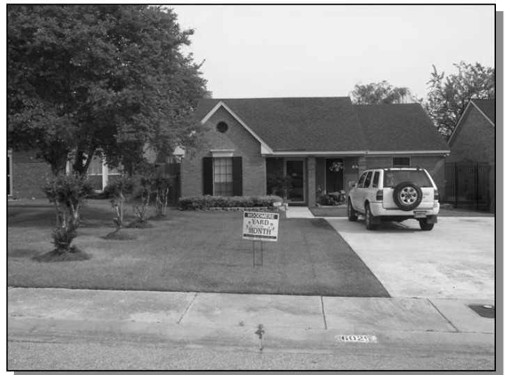
6025 Bolingbrook Drive