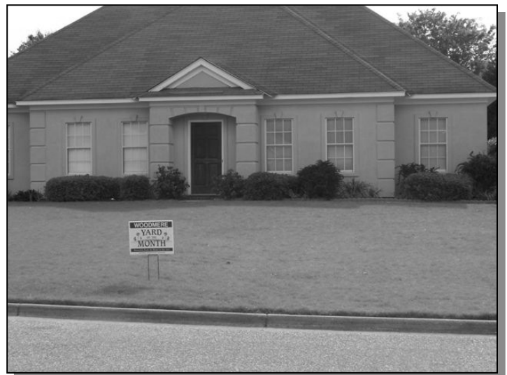
1865 Woodmere Loop