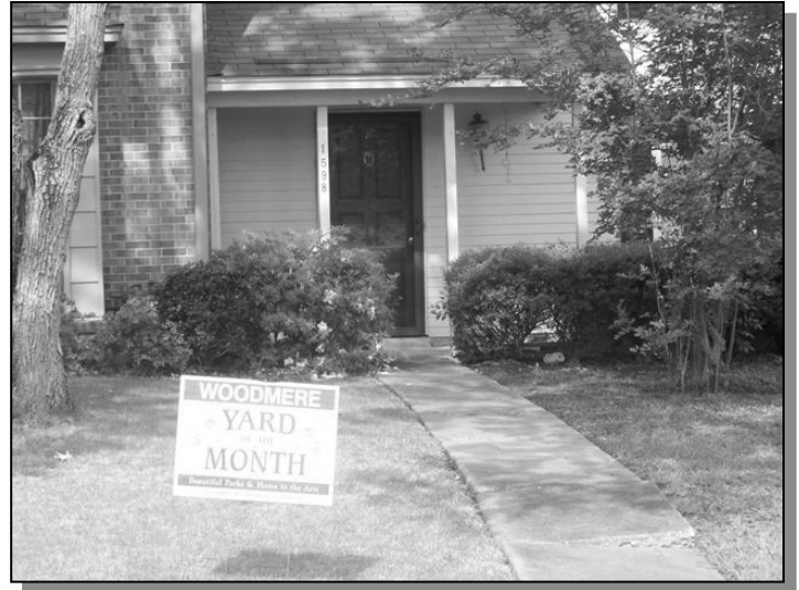
1598 Cobblestone Court