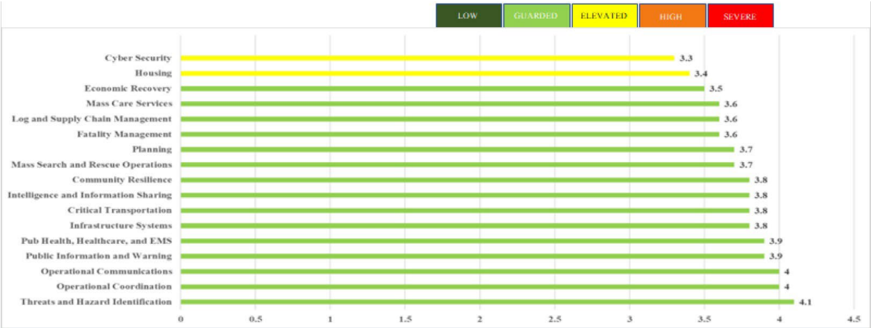
March 2023 IL-CATT THIRA Analysis – State Rollup Count of Threat Assessment by Threat and Rank