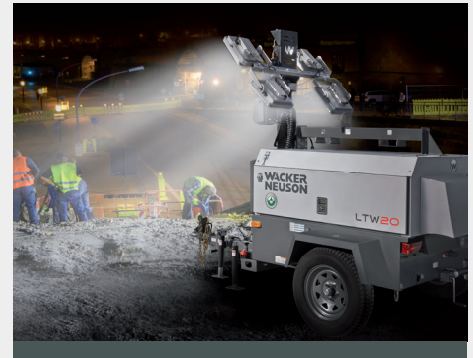
WIDE BODY, VERTICAL MAST:

LTV light towers offer full features in a small footprint. Models are available with 4 and 6 kW output and metal halide or LED lamps. Plus, extended service internals of 1,000 hours between oil changes lowers cost of ownership.