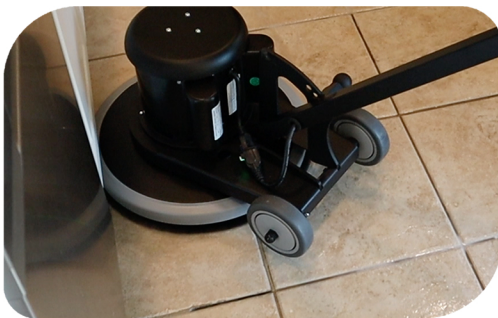
Tile & Grout Cleaning