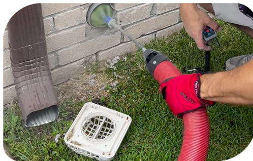
Dryer Vent Cleaning