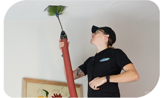
Air Duct Cleaning