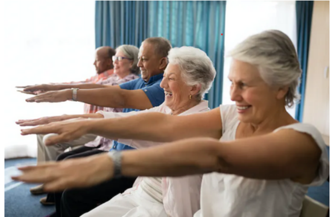
Seniors participating in a seated exercise class. Physical inactivity is a modifiable risk factor for dementia.

In short, by encouraging people to be physically, mentally and socially active, a significant number of dementia cases could potentially be kept at bay.