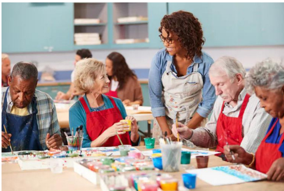
By encouraging people to be physically, mentally and socially active, we can potentially keep a significant number of dementia cases at bay.