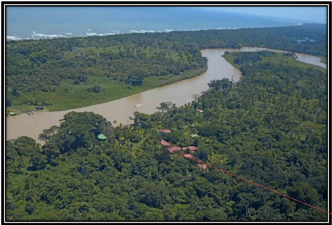
The Lodge is in the Jungle on the Rio Parismina River just before it flows into the Caribbean

We recommend RIPCORD for your Rescue Travel Insurance. They provide a one-stop integrated travel protection program for adventurers and 24/7 contact with medical and security professionals. They are a medical and travel security risk company that provides worldwide evacuation and rescue services from your point of emergency all the way home. www.ripcordrescuetravelinsurance.com/portal/highmtnhunts