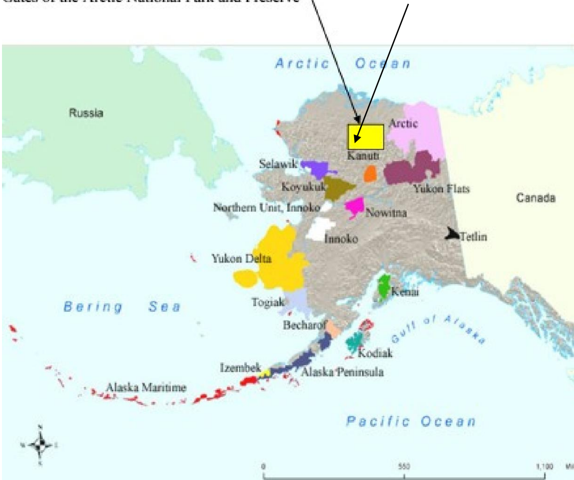
Gates of the Arctic National Park and Preserve

“We view our guiding as a part of our subsistence lifestyle. All meat that remains after the guiding season is used both by our family, fellow guides, and other bush residents for their winter's supply of meat. As a result, these trophy animals fulfill a hunting dream; provide income for remote Alaskans as well as our supply of meat for the winter months. We believe that the animals that are harvested in our activities could not be more fully utilized and appreciated in any other manner”.