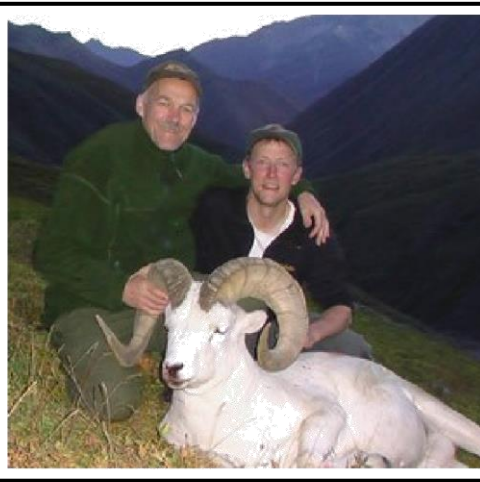
SHEEP HUNT IN