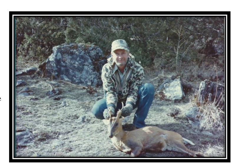
Muntjak (Barking Deer)

Price Includes: Meet and greet at Kathmandu airport and firearm permits. Horses are available if desired and included in the price. Price Excludes: $3,000 concvession fee to be given to the local village, Visa and customs clearance, hunting license and permit fees, international air fares ( Korean Airlines), domestic helicopter air fare recommended from Katmandu to Dhorpatan (r/t $4,000 each on cost sharing basis with two hunters. Small helicopters flying to high altitude base camp (11,000 ft) total load capacity is 720 lbs. which includes the weight of the passenger. Pack light!), trophy shipment, insurance, tips, extra hunting days, hotel accommodation and food before and after the hunt, hotel extras, personal expenses, non-hunter, special food, cost of medications,