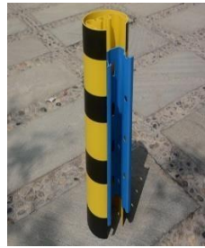
Plastic upright protectors