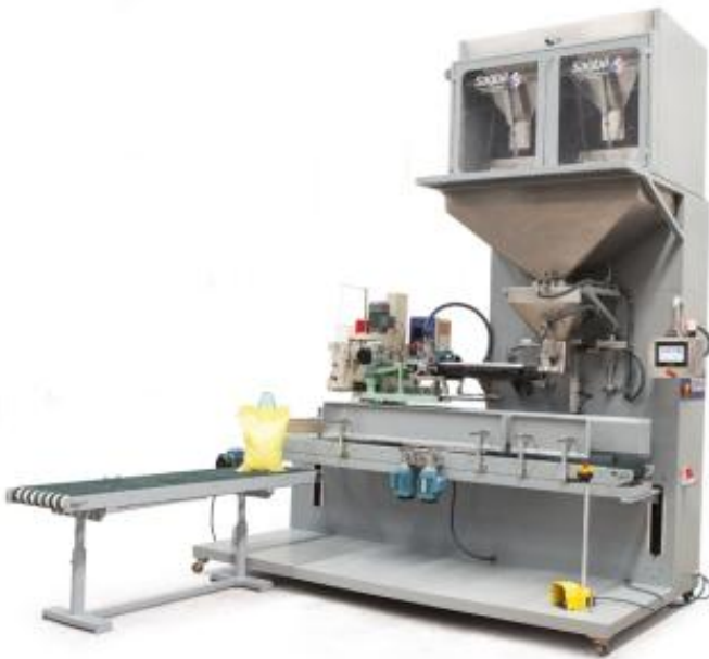
SACK FILLING & SEWING SYSTEM - GRANULAR