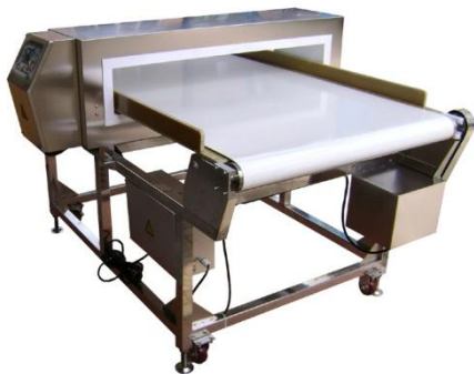
WIDE METAL DETECTOR – BELT TYPE