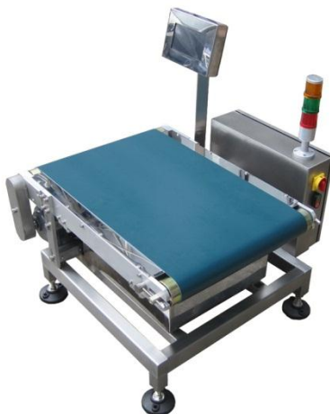
CHECKWEIGHER – BELT TYPE