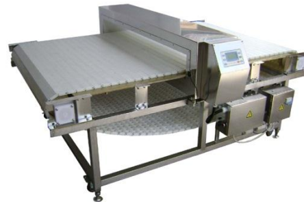
WIDE METAL DETECTOR – MODULAR BELT