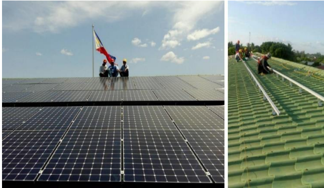
Residential Roof Top Canopy