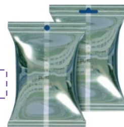
PUNCH AND GUSSET