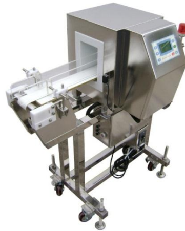
METAL DETECTOR – TALL PRODUCT