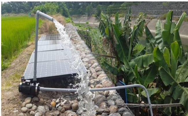
Solar Water Pumping System