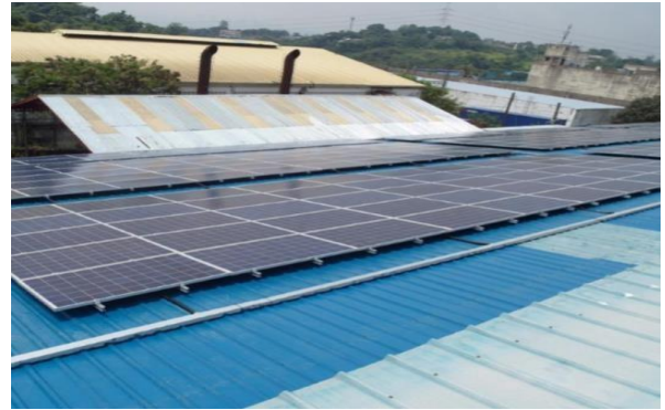
Factory Metal Roof Top