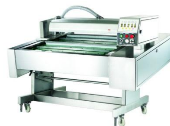
CONTINUOUS VACUUM BELT