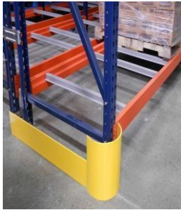
Pallet rack frame protector