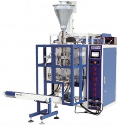
AUGER FILLING SYSTEM