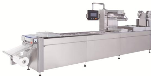
THERMOFORMING PACKAGING MACHINE