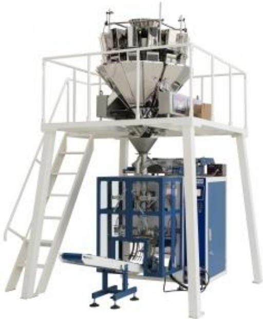
MULTIHEAD WEIGHER WITH VFFS