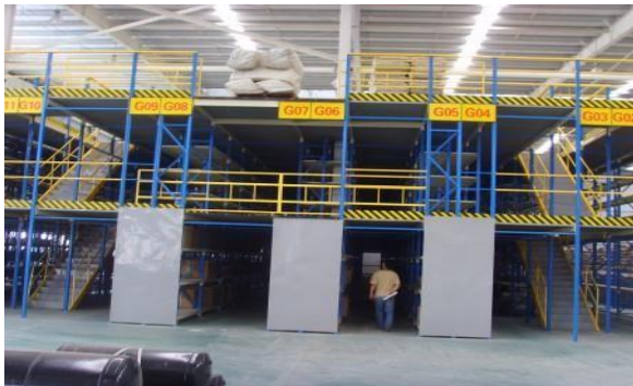
Free design Warehouse Mezzanine Floors Systems Steel Structure Mezzanine Floor