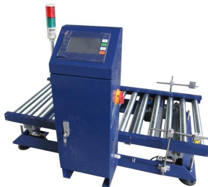
CHECKWEIGHER – ROLLER TYPE