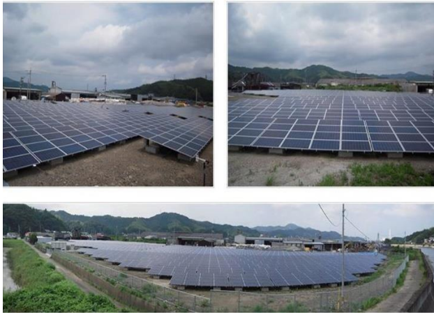
Ground Mount Power Plant