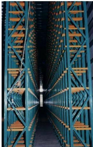
Mini Load AS/ RS system