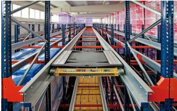
Radio Shuttle Racking Pallet Storage System