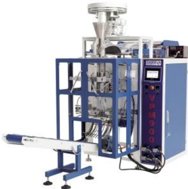
VOLUMETRIC FILLING SYSTEM