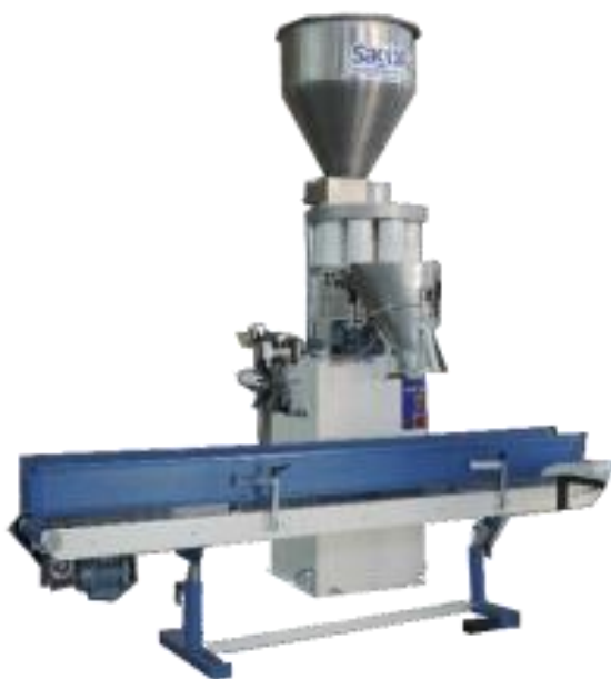
MANUAL SACK FILLING SYSTEM - GRANULAR