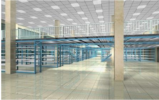
Design warehouse storage steel mezzanine Platform