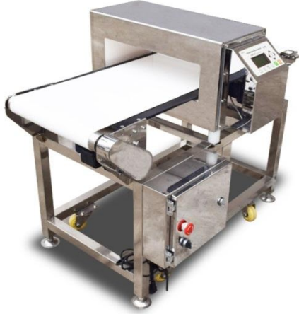
DIGITAL METAL DETECTOR