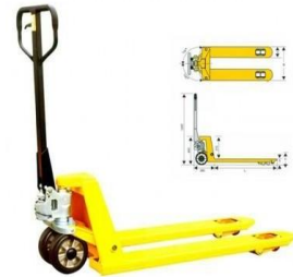
3 Ton Hydraulic hand pallet truck