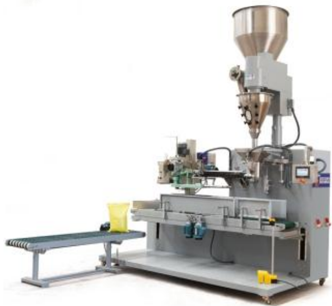
SACK FILLING & SEWING SYSTEM - POWDER