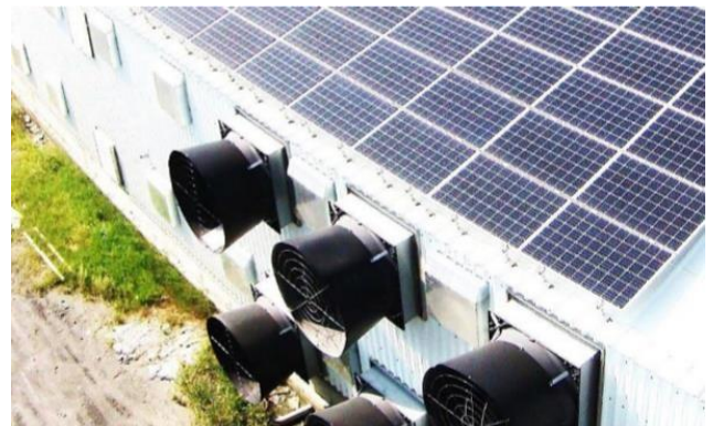
Solar Ventilation System