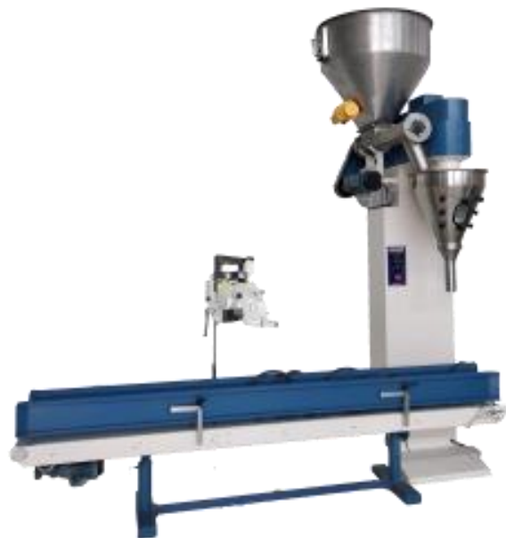
MANUAL SACK FILLING MACHINE - POWDER