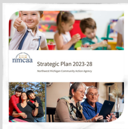
NORTHWEST MICHIGAN COMMUNITY ACTION AGENCY Strategic Planning