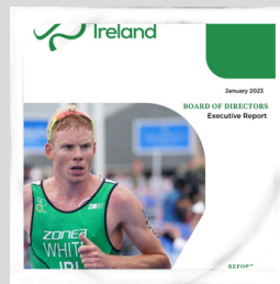
TRIATHLON IRELAND Board Reporting & Key Performance Indicators (KPIs) Progress Document