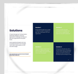
INSPIRIT PROJECT MANAGEMENT Pitch Deck