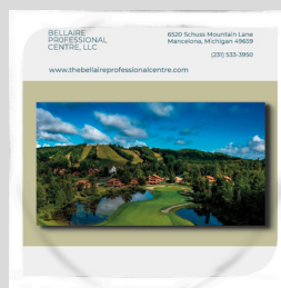
BELLAIRE PROFESSIONAL CENTRE Employee Handbook