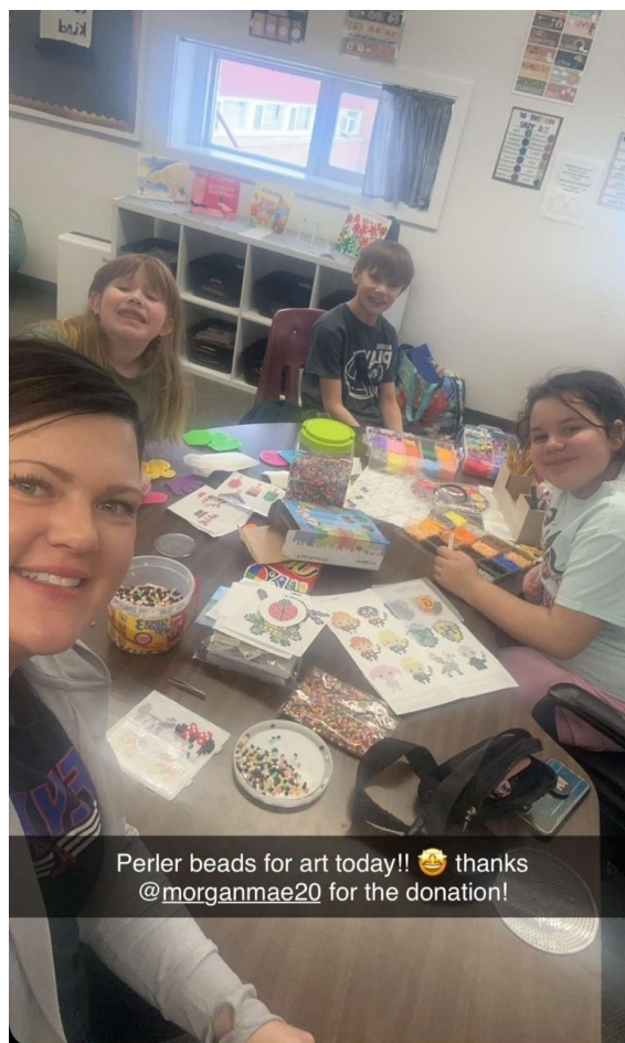
Perler beads for art today!! 🙌 thanks @morganmae20 for the donation!