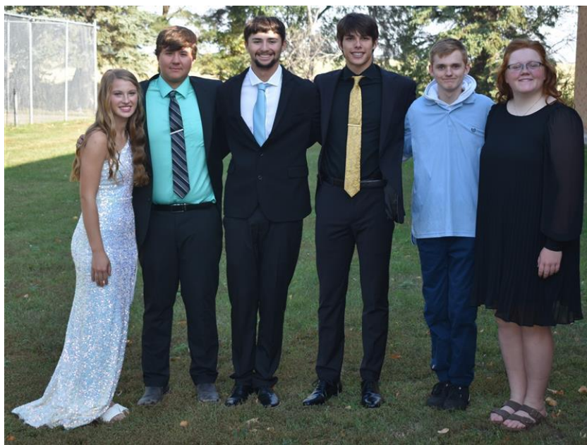
Senior Class of 2024