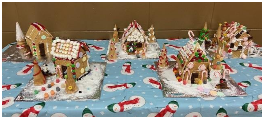
Great Job Kids!!