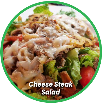
Cheese Steak Salad

Fresh grilled chicken, lettuce, tomatoes, cucumber, onions, Kalamata olives, sautéed red peppers, artichoke hearts and fresh mushrooms – 12.99