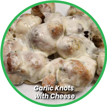
Garlic Knots with Cheese

Jumbo, oven-roasted wings. Spicy, Sweet BBQ, Teriyaki or Plain. Boneless or with bone. (10) – 12.99