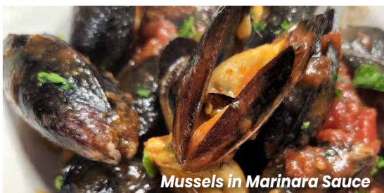
Mussels in Marinara Sauce