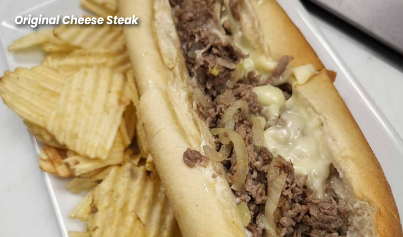
Original Cheese Steak