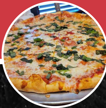
Pizza alla Margherita