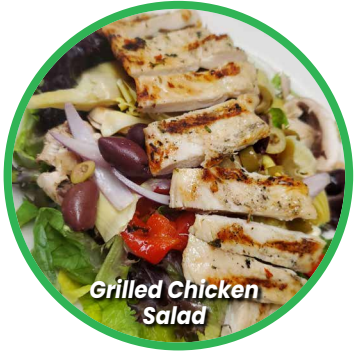
Grilled Chicken Salad

Sautéed steak, onions, green peppers and mushrooms over a bed of crisp romaine, with tomatoes and melted cheese – 12.99